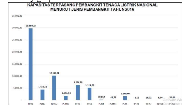
Figure 1.1 The Utilization of energy resource from Kajian ESDM 2017

Indonesia is the nation with abundant of natural resources. Natural resources itself in kind of crude oil, natural gas, coal, geothermal, hydropower, wind, and biomass become the commodity which is targeted to enhance economic development by utilizing them as the object for electrical supply in Indonesia, especially for nation electricity need. In Indonesia, the index for electrification reaches up to 94.91% in 2017 and continuously increasing year by year (ESDM, 2017). It is targeted that in 2020, the ratio of electrification reaches 100% which means that all the regions in Indonesia has already been installed the power plant to suffice society need. According to the data issued by ESDM, the energy resources used is shown by graph below: